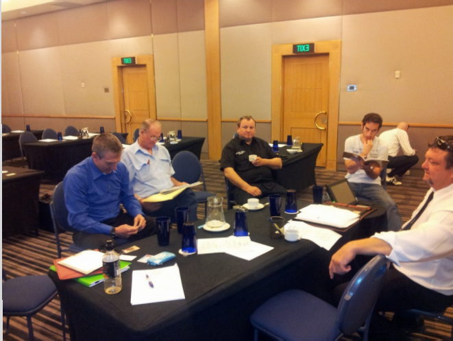
Executive meeting discussions on the year ahead.