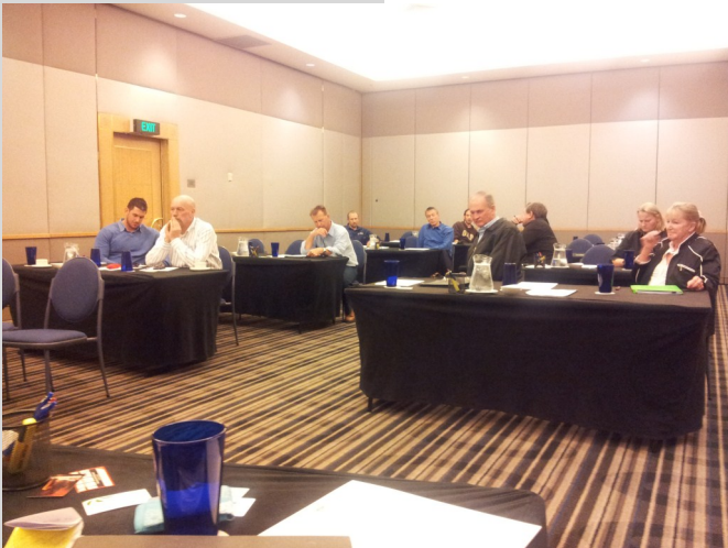
Members and Guests start to arrive for the AGM